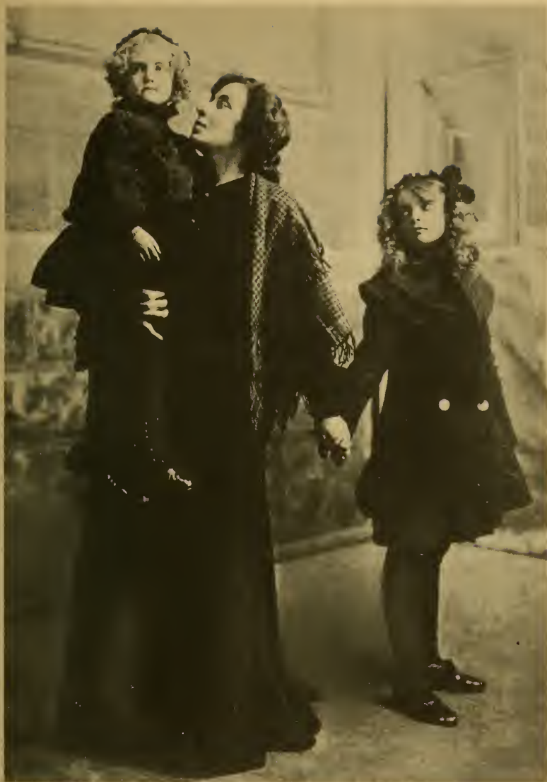
A SCENE FROM "HER FIRST FALSE STEP"